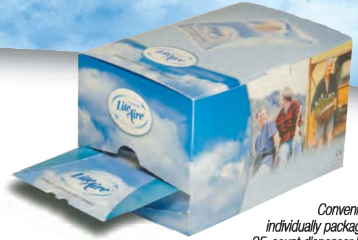
Convenient, individually packaged, 25-count dispenser box.